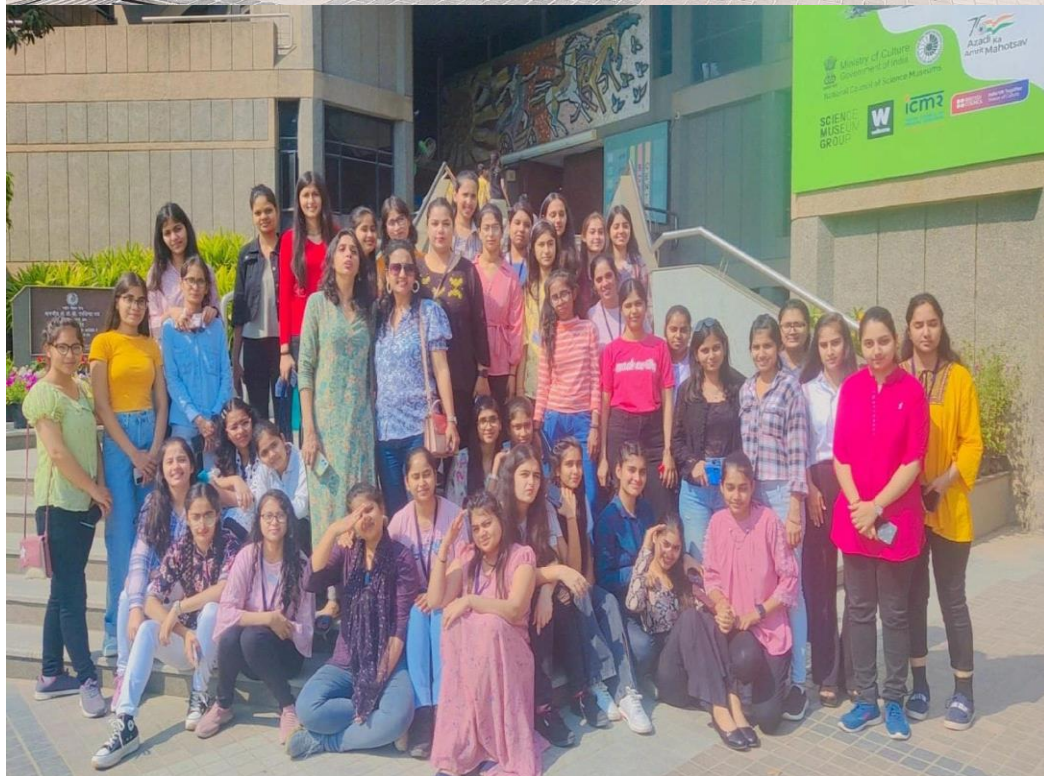
11/03/2023: Educational visit to National Science Centre by Biotechnology Students