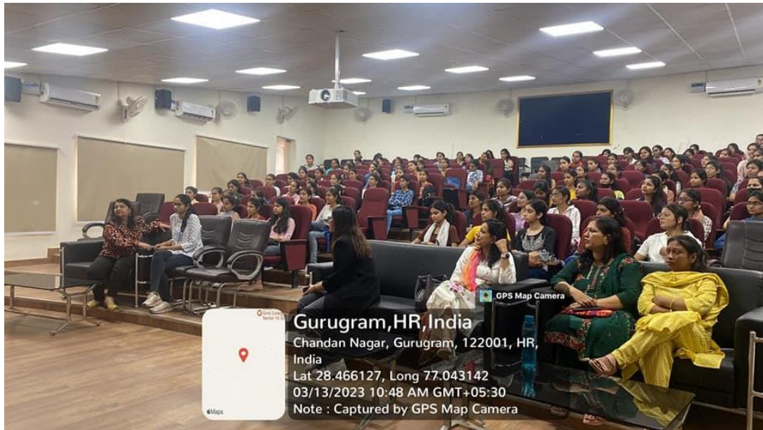
(02-30)/03/2023: 21 st Century skills by NIMAYA Foundation