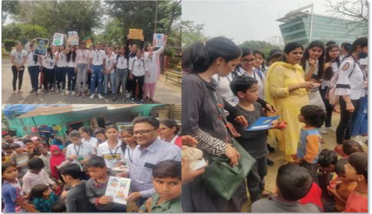
2023 Environmental promotion activity in “Chandan Nagar Basti”