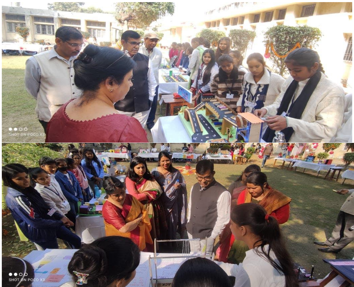
5/12/2022: College Level Science Exhibition