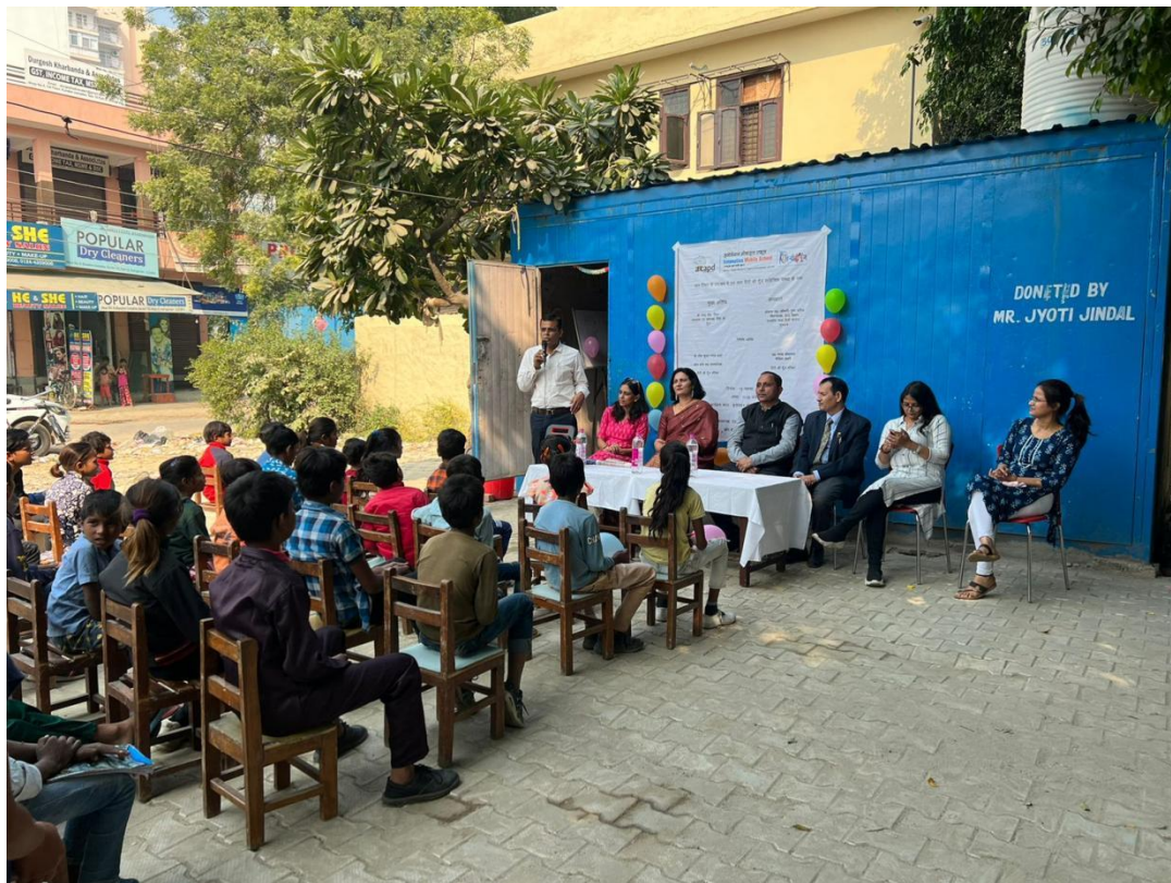
Teaching in the orphanage