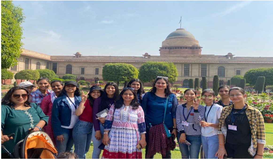
28/02/2023: Education trip of Botany students to AMRIT UDYAN